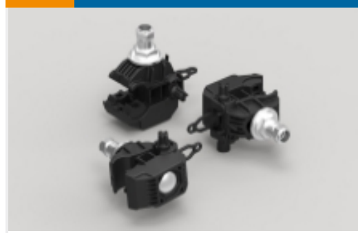
Street Lighting Connectors(6)