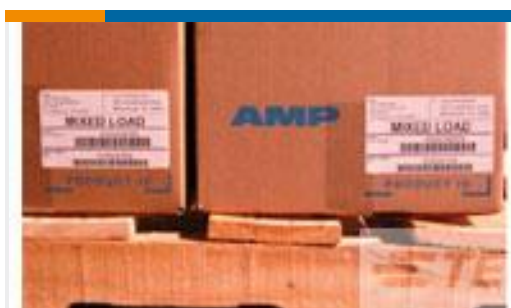
TE Part # F84258-000 EP-191064-10-9