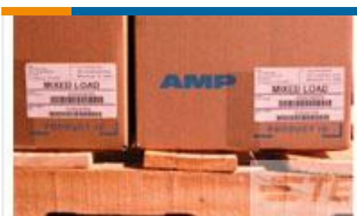
TE Part # A77099-000 EP-101635-2.5-9